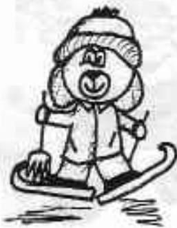
from The Mini Page