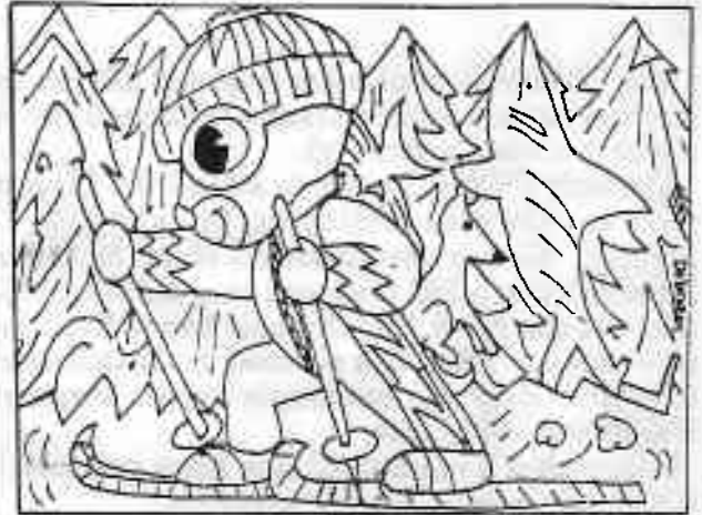
from The Mini Page by Betty Debnam © 1992 Universal Press