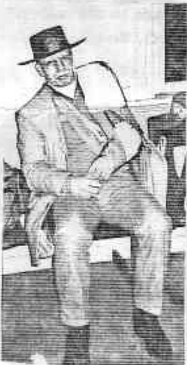
BURR at Stowe 1993