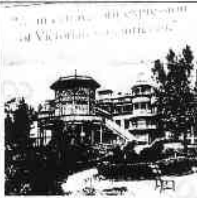
Cabin John Bridge Hotel (old photo) built in late 19 th century and in operation until 1924. Burned down in 1931.