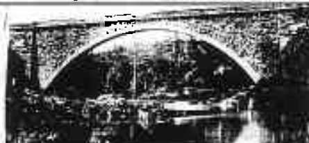
Cabin John Bridge (also known as the Union Arch - old photo). This was finished at the beginning of the Civil War for the aqueduct system bringing water to Washington from Great Falls. It is still in use today. At the time its construction, it was the largest stone arch in the world.