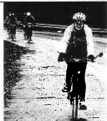
Cyclists on MacArthur Blvd bikepath. A little rain didn't stop our crew!