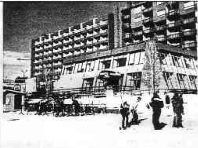
Left: Steamboat Sheraton

Call Wilma at 301-975-9411 or email Wilma@sharerassociates.com to make your reservation. A few spaces are still available.