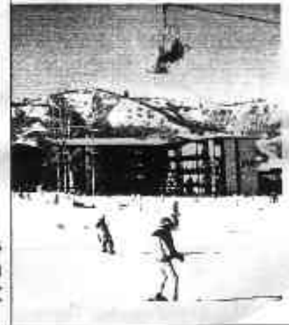
Right: Snowmass Mountain Chalet