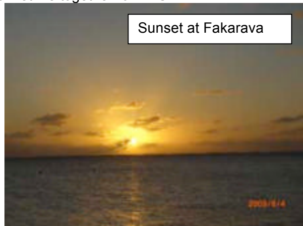
Sunset at Fakarava