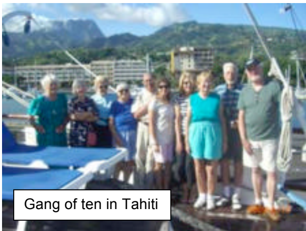
Gang of ten in Tahiti