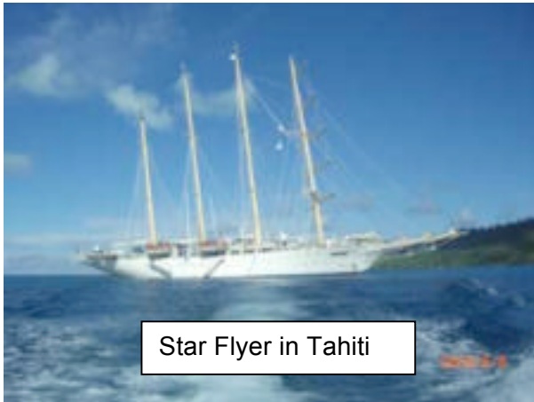
Star Flyer in Tahiti

French Polynesia is a single entity governed by France and consisting of several distinct groups of islands and atolls, some close together and others far flung, sprinkled about the south pacific, far south and actually east of Hawaii. Tahiti, Moorea, Bora Bora, Huahine, and Taha'a are part of the Society Islands while Rangiroa and Fakarava are atolls in the remote Tuamotu Archipelago, a day's journey away (some 250 miles) by sailing ship from the other more well-known islands of French Polynesia. This was indeed a special adventure; we reached destinations that visitors to just one of these little islands miss by staying in one place.