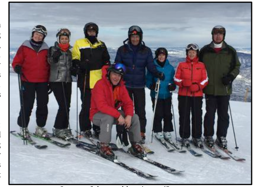
On top of the world at Aspen/Snowmass

The Blue Ridge Ski Council trips for 2017 are: Breckenridge, CO, early February and Grindelwald, Switzerland, early March. Leading a PVS contingent on a BRSC trip is relatively uncomplicated, since most of the arrangements are made by the BRSC-leader; your involvement mainly is in coordinating the PVS participants.