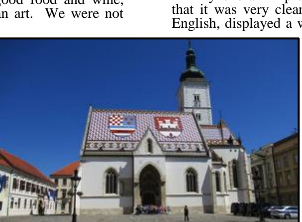
St Mark's Church in Zagreb

From Zagreb, our group bused to the Plitvice National Park, home to 16 lakes, numerous waterfalls and cascades, and miles of rickety, rotting, and elevated walkways made from uneven logs. was the only day with rain, but only a little, and we enjoyed the scenery.