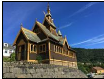
St. Olaf's Church