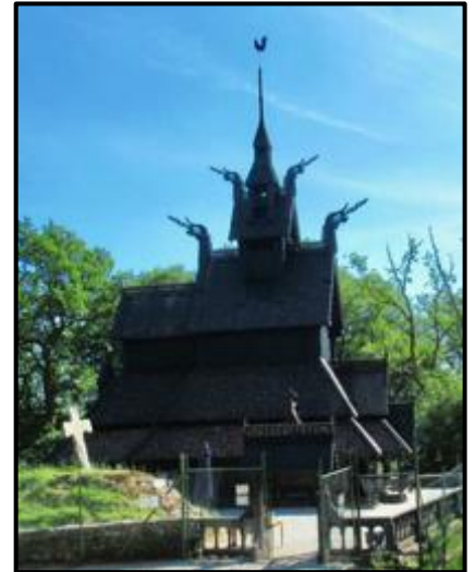
Fantoft Stave Church

I am quite fond of art museums, but the Bergen CODA did not offer much to me. Wonderful art would have to wait until Oslo.