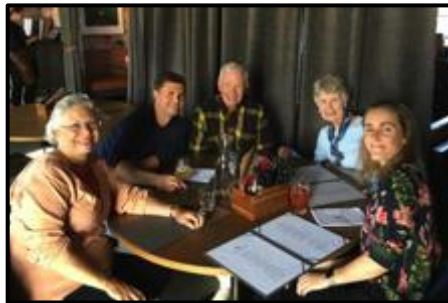
Family group photo