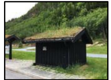
Roadside reststop bathroom

This ends my travelogue. I'll add a few observations. The women did not appear particularly stylish to me; the general public did not appear to be as glued to their cell phones as we Americans are; lots of beer and wine on every lunch table; bread everywhere was in-house baked, grainy and delicious; dairy was rich; cheese was scrumptious; cod was very good; complementary water pitchers of tap water with glass glasses EVERYWHERE no matter the casual level of the restaurant, café, cafeteria, or bar; grass roofs on old houses and in the country (see photo above); universally English speaking; expensive – my one glass of wine each day cost between $12 and $16; nearly a cashless economy (one of our hotels advertised as cashless); usual European lack of unpacking space in hotels; not one hotel room had a safe; friendly and helpful people; and, all told, a recipe for a great time.