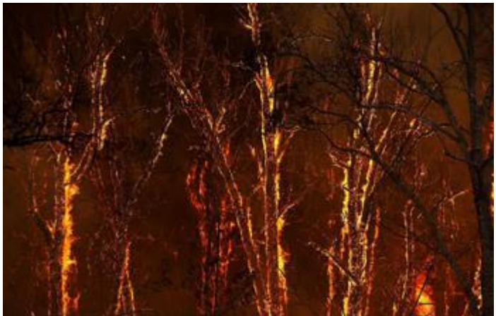
Flames from the Carr Fire burn through trees along Highway 299 on July 27, 2018, near Whiskeytown, California.