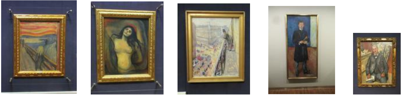
All Munch paintings

The surprise of the trip – I loved the anguished art of Edvard Munch (of Scream fame). We visited the Munch Museum as well as the National Art Museum. Both museums had rooms of Munch's works. The much parodied Scream was among my least favorite of his paintings. I asked why the West knew so few Norwegian artists and the response was that the artists did not sell their works internationally.