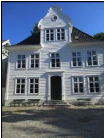
House in Gamle Bergen

We visited an open-air museum of 18 th and 19 th century life with costumed guides explaining a bit about life in the old times. Later, we witnessed a modified flash mob doing some dance steps in a Bergen street. Fun.