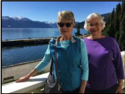
Balcony at hotel

We took a four-hour ferry ride from Bergen to tiny Balestrand staying in the historic 1877 Kviknes Hotel, which hosted a historic buffet each evening. There were Norwegian salmon five ways and everything else one could want. This was not the Golden Corral. We could see the Sognefjord, Norway's largest fjord, from our hotel window. The tiny town also boasted St. Olaf's Church completed in 1897 in the neo-stave style. The coronation church in Frozen was patterned on this church. My 3½ -year old granddaughter was impressed. On the second day, we took a ferry on the Fjaerlandsfjord to see a glacier and attendant museum. Scarily, the glacier has shrunk dramatically in the last ten years.