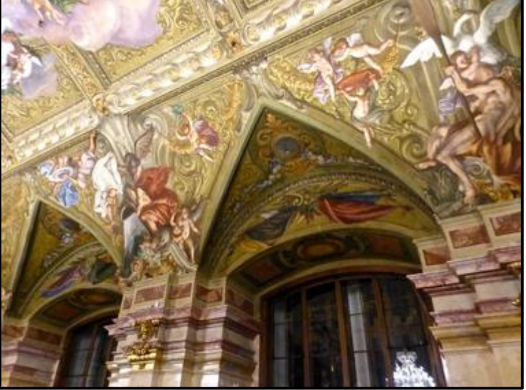
This portion submitted by Louann Eadie.

several members of our group headed to other European destinations. We were delighted by the beautiful Parkhotel Schonbrunn, conveniently located near a subway stop and close to the Schonbrunn Palace, and enjoyed the wonderful breakfast buffet with its excellent "Vienna" rolls. In Vienna, many members of our group participated in the tour the first full day in the city. With the incredible variety of attractions offered by Vienna, members of the group went their separate ways to pursue their particular interests. Cara and Bob Jablon were fortunate to have procured tickets to La Traviata; Louann Eadie, Peter Russell, Margaret Wyckoff, and others filled their schedules with a multitude of concerts, including Mozart's Requiem at St. Stephen's Cathedral. They were also able to see the Lipizzaner Horse Show and