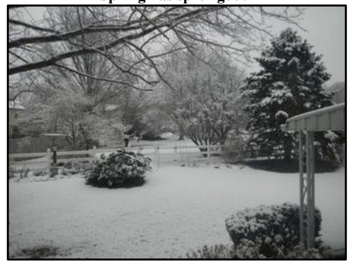
March 21, 2015 Olney, MD First Day of Spring

After a rough February with more snow than anyone wanted to shovel, can Spring really be here? I think we are all ready for cherry blossoms, forsythia, daffodils, tulips, and azaleas.