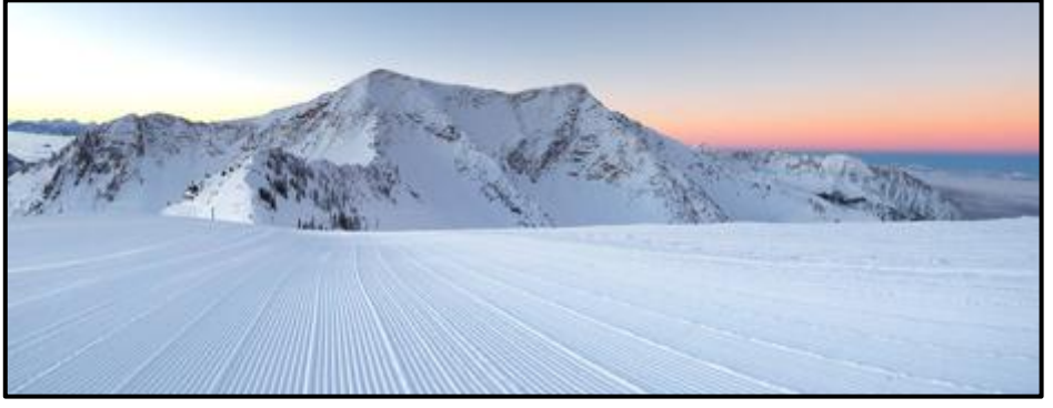
Corduroy at Snowbird, UT

Snowmass this year to rave reviews and has agreed to lead the trip for 2016. This trip will be scheduled