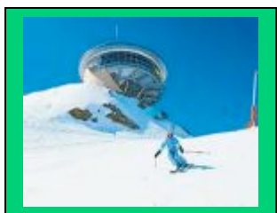
Upper Lift Restaurant

Skiing in Andorra is World Class, with 7,600 acres, a vertical of 3,575 feet, 111 lifts with a capacity of 156,390 skiers/hr, and 187 mi of runs.