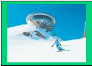
Upper Lift Restaurant

Potomac Valley Skiers is joining BRSC for a true gem of a ski trip—to one of the smallest and most mountainous countries in the world—Andorra, a skier's and tourist's paradise. And we'll visit spectacular Barcelona. There are optional trips: to Madrid and the Prado Museum, the medieval, walled city of Carcassonne, France with its winding cobbled streets, and turrets—a World Heritage Site. We'll have the opportunity to visit the fortress city, Toledo with its Christian, Jewish and Islamic heritage, and Segovia and Avila to see the 2,000-year old Roman aqueduct, the fairyland castle of Alcazar and much more. Skiing in Andorra is World Class. It has 7,600 acres, a vertical of 3,575 feet, 111 lifts with a capacity of 156,390 skiers/hr, and 187 mi of runs.