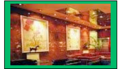
Crown Plaza Lobby

Our 10-day, 9-night trip includes: 2 nights in historic, vibrant Barcelona; 7 nights at the 5-star Crown Plaza Hotel in Andorra's capital, with two people per junior suite—and including breakfast and a daily 5-course themed buffet dinner! We include your Emergency Medical and repatriation insurance, a pre-trip party, a welcome party, a mid-week Apres Ski party, a Grand Finale Dance in the ballroom and a post-trip party. We will also offer a 4-night post-trip extension to Madrid including three superb tours.