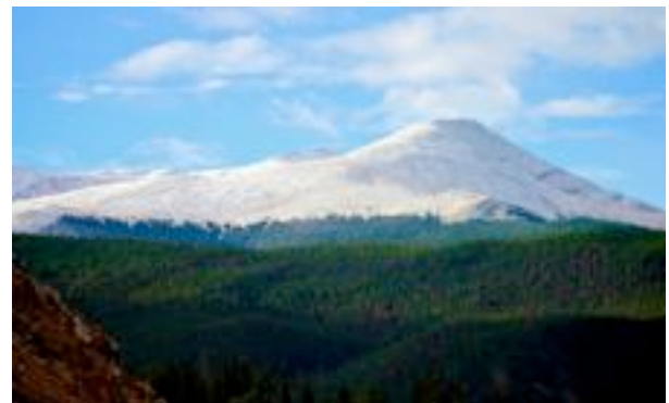
Breck's 10 Mile Range had a nice coating of the white stuff.

Let me know if you want to get on the Local Ski list.