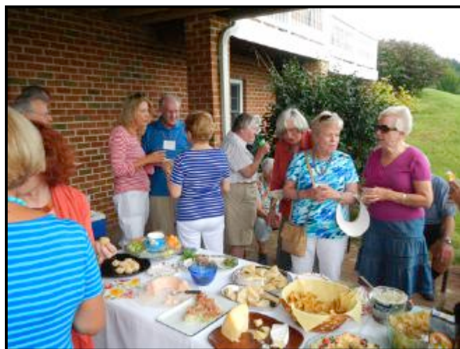
PVSers partaking of the fare and sharing amongst friends