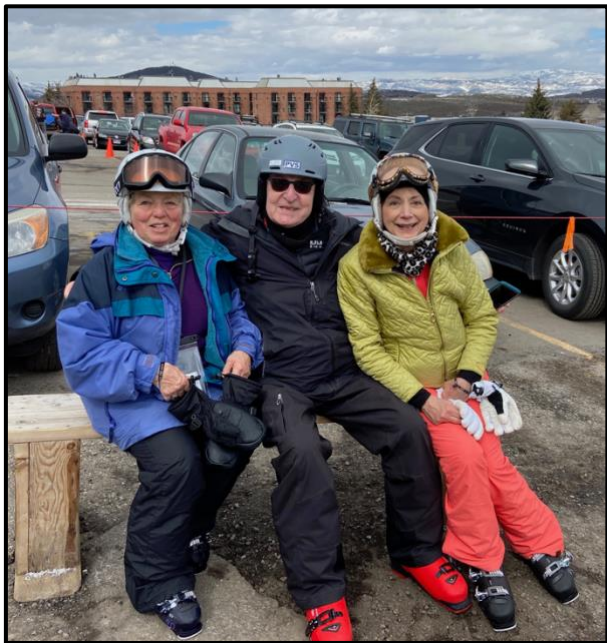
Waiting for the bus