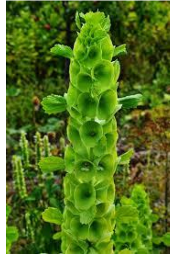
Bells of Ireland

A tradition is tied to folklore that says wearing green makes you invisible to leprechauns, which like to pinch anyone they can see. Some people also think sporting the color will bring good luck, and others wear it to honor their Irish ancestry.