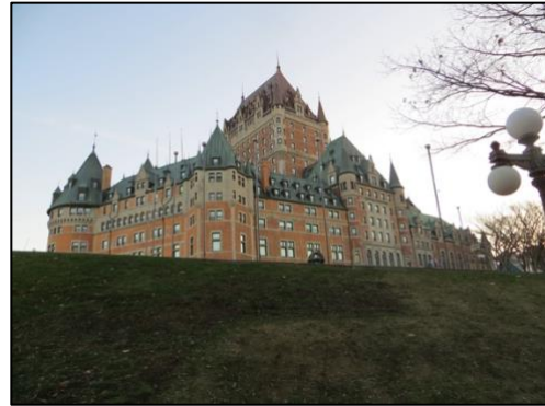
Quebec - Chateau Frontenac