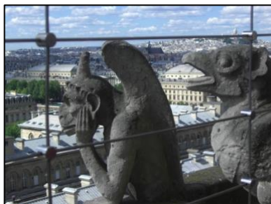
Gargoyle on Notre Dame roof