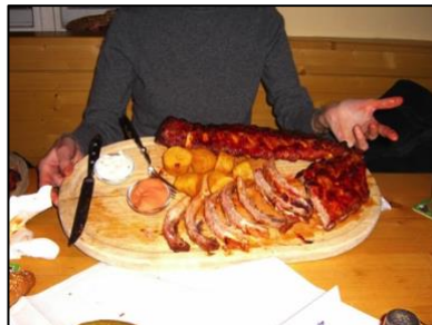
Ribs in Vienna for Thanksgiving