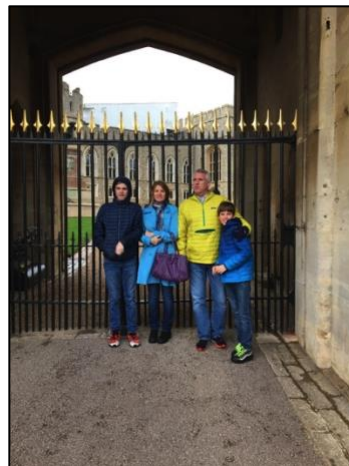
Daughter and family at Windsor Castle and Tower of