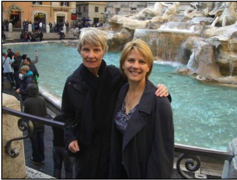
Rome - Trevi Fountain

Two years later, we broke our rule about nonstop destinations only, and headed north to Quebec where we stayed at the Chateau Frontenac (a strong desire of mine).