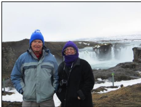
Brother and SIL in Iceland