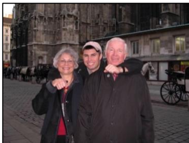
SIL, nephew, and brother in Vienna

We were getting the hang of this whole thing, so we next took off for Amsterdam where my son proposed to his now wife in Dam Square. Photo is a reenactment.