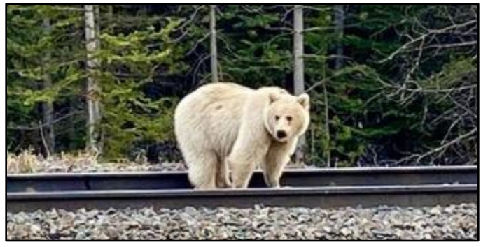
Locals of Banff have named the bear Nakoda